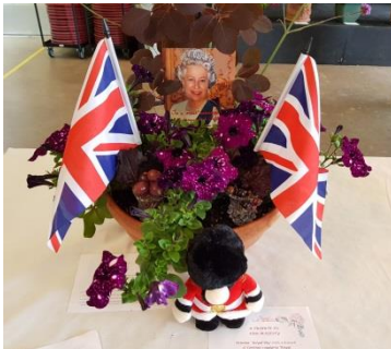
The winning entry in the Group Class

A Group Class, for 1 to 6 people to jointly enter, choosing to put together a display of four items from a choice of 16 proved to be a popular choice with exhibitors. Exhibits in this class included photos, flowers, pictures, handicrafts and interesting containers.