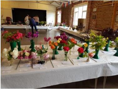
The judges hard at work

Walking into the Old Drill Hall at the Youth Centre on Bellingdon road in Chesham on the 2 nd July, the exhibits slapped your senses. The colours and variety of blooms, along with other