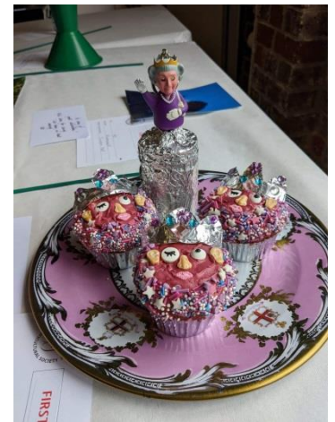
The winning entry in the Decorated Cup Cakes Class: Theme - Jubilee

afternoon was rounded off with an entertaining raffle with fabulous prizes.